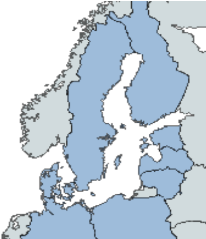
Baltic Energy Market Interconnection Plan (BEMIP)